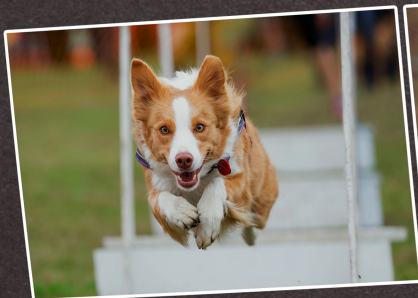
Fly ball fun