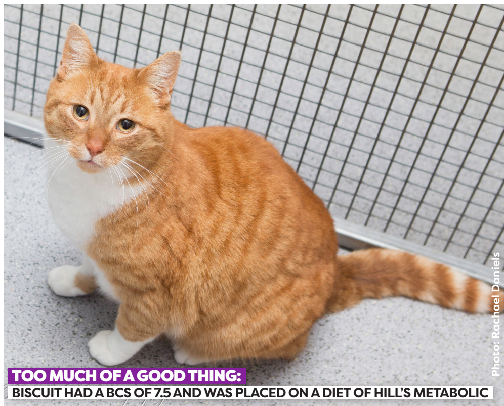
TOO MUCH OF A GOOD THING: