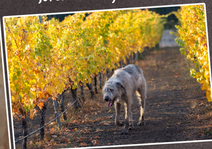
Puppies at Wobbly Boot