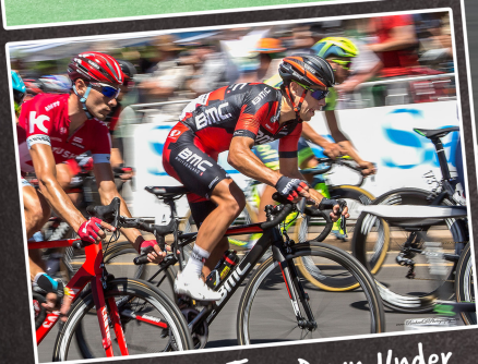
Hockey & Tour Down Under